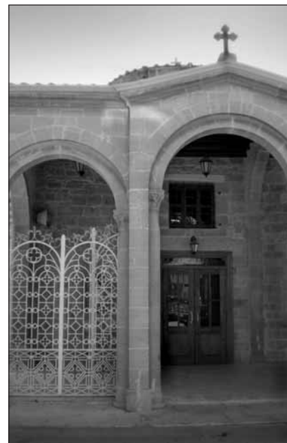
west side of the building