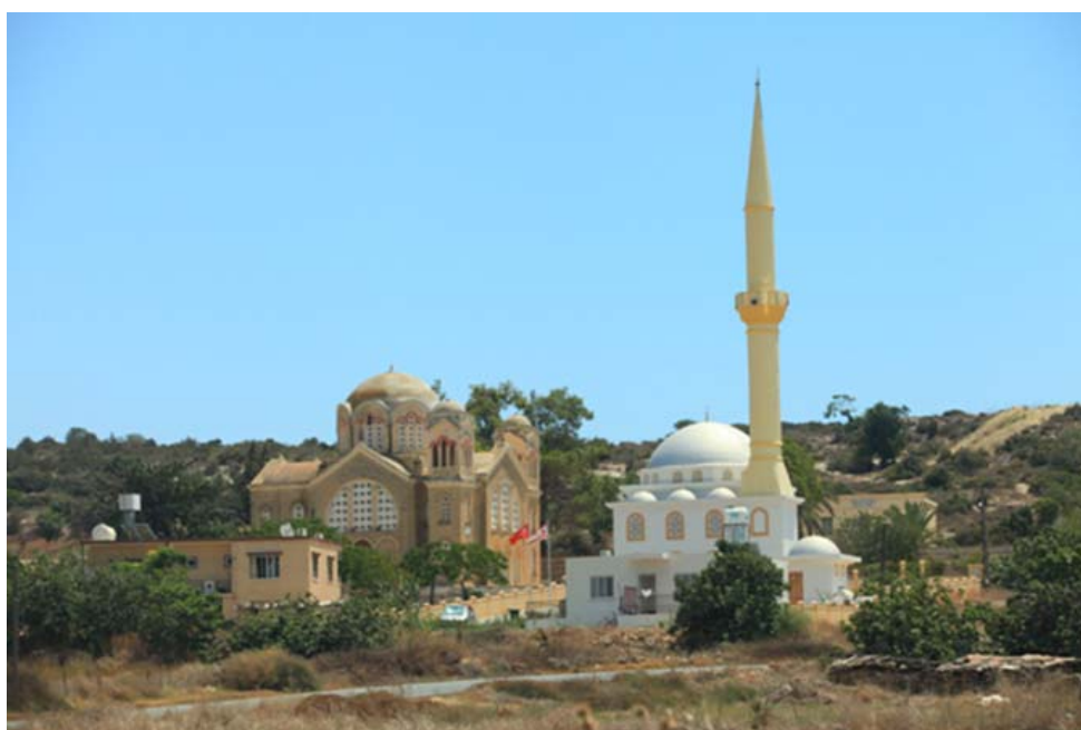
Figure 4 Newly Built Mosque Standing Side by Side with Empty Church (in the Past for a Period Converted into a Mosque)