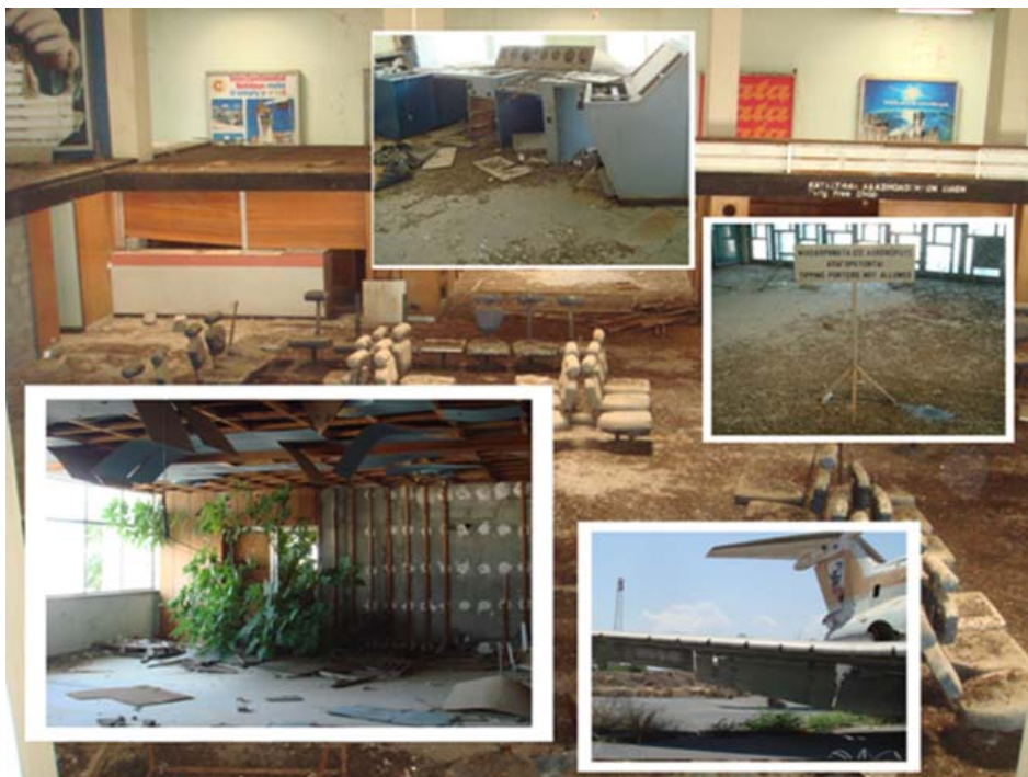
Figure 11 Collection of Photos from NIC Visit in 2011

Not any more. The gutted traffic control room, the carpeting of bird droppings, the shattered glass around bulletted window panes, the ripped advertisement screens in the former check-in area, the flaking signs on random pillars and the bombed aircraft hull on the side of the runway, are all signatures of Nicosia International Airport in its