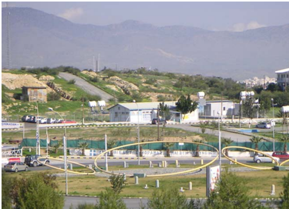
Figure 10 View of the Roundabout near the Nicosia Airport, January 2012 (Note Slogan on the Wall of Military Post)

The integration of Nicosia Airport into the spatial fabric of the city in a way that would fold its heritage value into narratives of the conflict has, until recently,