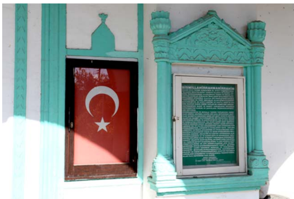
Figure 1 External Façade of a Church Converted into a Mosque

Apart from such official pressure, the visits of Greek-Cypriot refugees and the way they reacted to the 'destruction' also played a role in the drafting of the new heritage policies in the north. Many refugees, when visiting their churches, brought icons and