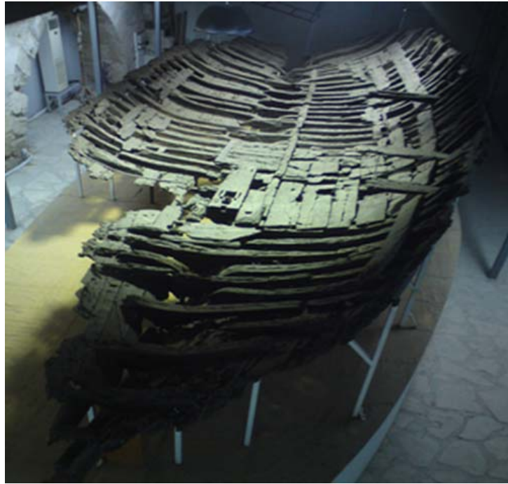
Figure 6 Kyrenia Castle Original Shipwreck