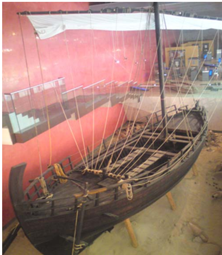
Figure 7 Thalassa Museum Replica of Kyrenia Ship