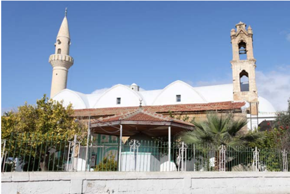
Figure 2 A Church/Mosque with a Minaret Added

candles and placed them at church entrances, or within the church itself, wherever entry was possible. In the case of ruined churches, they often attempted to clean them, and used particular corners for candle-lighting, thus reclaiming the site (Figure 3). According to many Turkish Cypriots, such peaceful attempts to reclaim religious sites created considerable anxiety in the locals living near them or using them. Ömer, the Turkish-Cypriot mukhtar of a former Greek-Cypriot village that is now populated by Turkish-Cypriot refugees from the south, told me that in the said village the church had been converted into a mosque. Many people, he said, ‘stopped going to mosque in the wake of such visits, because they kept finding lit candles and small icons at the entrance of their mosque’.