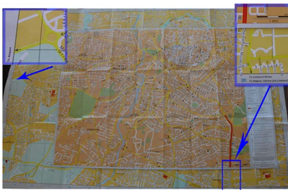
Figure 9 Older (Underneath) and Newer (on Top) Maps of Wider Nicosia Area with Close-ups of Old Airport Road (Left) and New Airport Highway (Right)

Nicosia International Airport (NIC) has not been listed on flight schedules since 1974, when the bombing by Turkish planes attacking Nicosia and since controlling the northern part of both the city and the whole island, closed it down. The entrance to the wider complex around the airport is blocked by a UN checkpoint, which now controls the airport and uses the wider area to headquarter both UNFICYP and the mission of political advisers that mediates between the Greek- and Turkish-Cypriot leaderships (the ‘Good Offices Mission’). Part of the area is under British UN command as it is formally a UK ‘retained site’ under the 1960 Constitution drawn up at the end of the British period, that is, a space within the Republic of Cyprus, which the UK could use at will and take control of in the event of war. 26 As a British UNFICYP officer put it, the UK has assigned this site for the use of the UN with a view to ceding it to the Cypriot state after an eventual settlement (in interview, UNPA, 13 July 2011). These are arrangements of sovereignty that like the airport, remain outside the purview of daily experience, which is instead strongly punctuated by the Graeco-Turkish dispute.