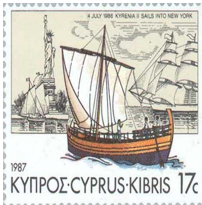
Figure 8 Commemorative Stamp of Kyrenia II in New York

The link of the Kyrenia ship to the national struggle of Greek Cypriots is thus explicit both in this and other speeches that politicians have periodically made, including