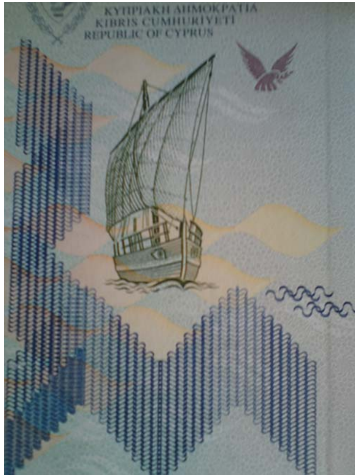
Figure 5 New Cypriot Passport

its legal as well as its symbolic ownership have been the cause for debate and acrimony. Under Turkish-Cypriot control, the original wreck is currently located and on permanent display in the medieval castle of Kyrenia in the north of Cyprus (Figure 6). Under Greek-Cypriot control, Kyrenia II is to be found on permanent display in the Thalassa Museum of Ayia Napa in the south-east of the island, ‘a life size exact replica of the ancient ship of Kyrenia’ (Figure 7). These two sites of ‘national’ heritage are intertwined with rival narratives and political claims on what the Kyrenia ship represents or ought to mean for the different communities of Cyprus.