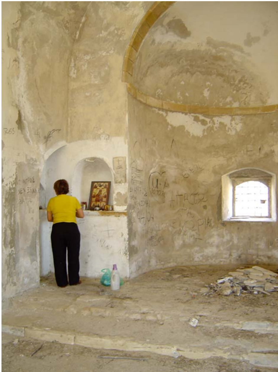
Figure 3 Reclaiming a Site